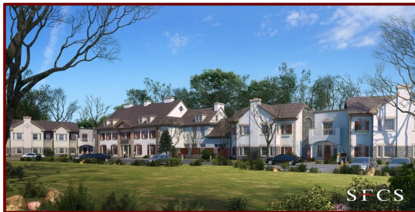
Rendering of the Mary J. Drexel Project.

The goal of this project is to construct a high quality senior-care living facility at a budgeted cost value. The owner wants the residents to have an “at-home” feeling instead of the traditional institutional/hospital feeling as many senior-care facilities have.